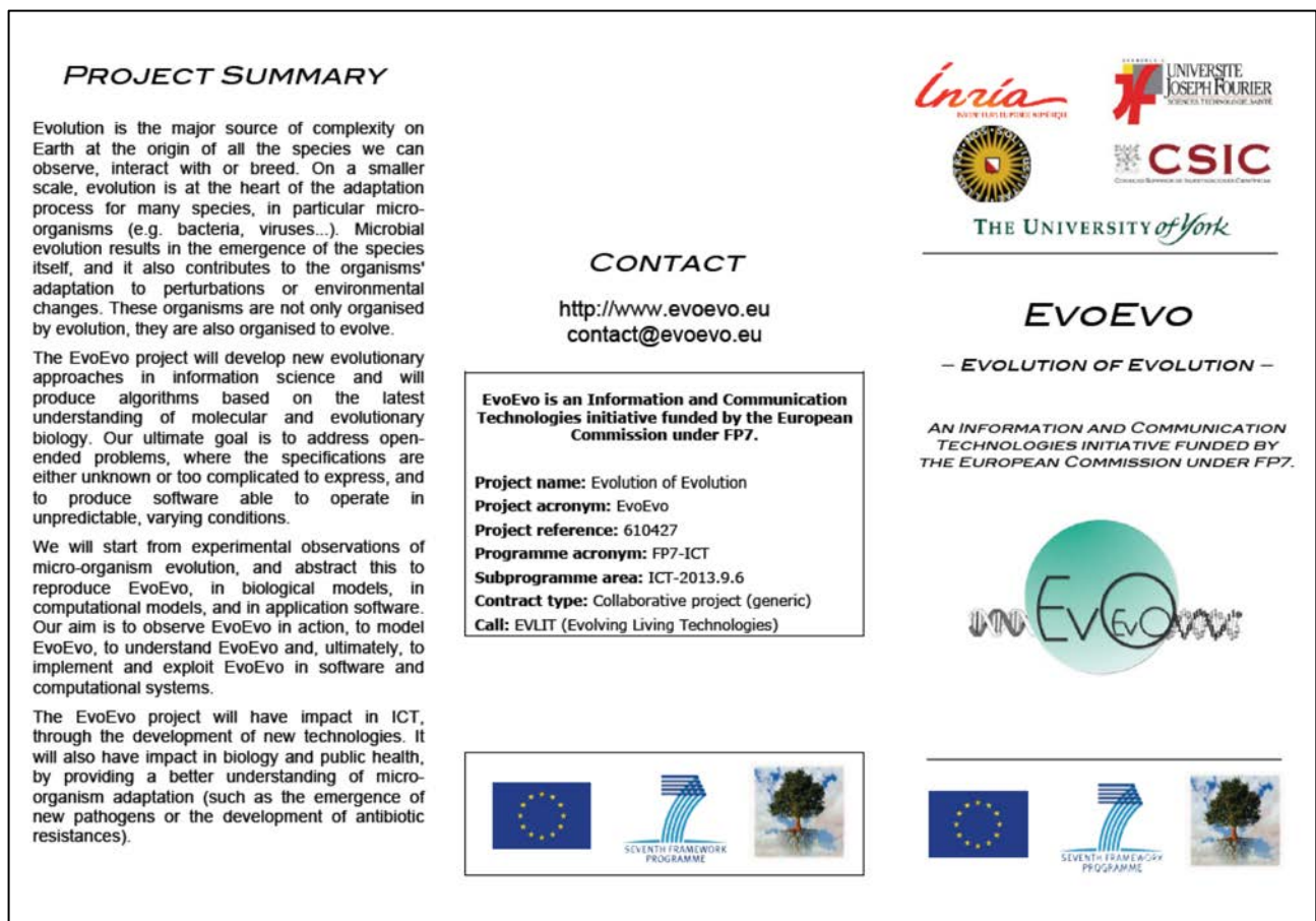
Figure 1: first page of the project Leaflet as it is visible from the website

Link to the project leaflet: http://www.evoevo.eu/download/2_-_media/leaflet_A4_V1.4.pdf